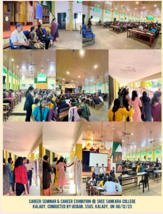
Career Seminar and Career Exhibition conducted at Govt Vocational Higher Secondary School Kadamakkudy and Sree Sankara College Kalady