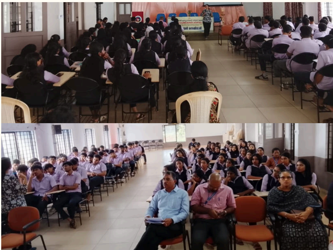
Career Seminar at Bharata Mata Arts and Science college choondy